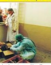
Chicks that have just hatched at the center are sold to villagers.

right away and is impatiently waiting for it to begin. He observed that factory-bred chickens are raised to lay more eggs, which are larger and whiter than desi eggs but lack their flavor and oomph. "We want the same good food for our children that our parents and grandparents had for us," Abbas said. "The problem is, desi eggs cost more, and they are hard to find. The others are everywhere." There lie the greatest obstacles to the success of the chicken-in-every-plot scheme: economies of scale, which keep factory eggs cheap, and reportedly widespread business practices such as warehouse boarding and price manipulation that benefit large food processors and brokers at the expense of small farmers. In a recent essay in The News International newspaper, Zaigham Khan, a Pakistani development professional, wrote that persistent