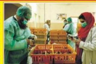
Poultry Research Institute staff vaccinate chicks.

eggs. Livestock officials estimate that five hens, laying several eggs each per week, can bring in at least 10,000 rupees ($75) a month, more than the salary of a security guard or construction worker. By crossing hardy domestic, hand-raised chickens known as "desi," or native, poultry with breeds from Egypt and Australia as well as Rhode Island Reds, the center has developed birds with the necessary qualities for backyard life: tough, omnivorous, disease-resistant and agile. "They can live in trees, in boxes, or under people's stairs," Rehman explained. "They can eat kitchen scraps instead of expensive feed, and they can outrun predators like cats and foxes." In contrast to the skeptics, many poor and working-class Pakistanis said they were excited to hear about the project and eager to sign up. Even more affluent families said they appreciate Khan's continued focus on the plight of the poor, which he vowed to prioritize during his campaign. "People may laugh at the prime minister over this, but I laugh at them. It is a wonderful idea," said Zahida Shah, a middle-class homemaker in Islamabad. She keeps a half-dozen chickens near the family's garage, mostly to provide extra nutrition for her grandchildren. "Here in the city peo-