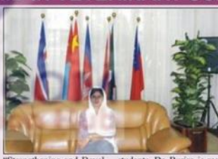
Strengthening and Development of Faculty of Sindh Agriculture University.