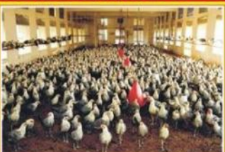
Roosters and hens are raised at the Poultry Research Institute in Rawalpindi as part of a program to provide chickens to poor families in Pakistan.

Rawalpindi, Pakistan The high-pitched cheeping of a thousand newborn chicks fills the humid room. Technicians pluck them from incubation trays, inject them with a vaccine against Newcastle disease, discard those with deformities and pop the rest into plastic containers, where they will travel in heated trucks to government farms and be raised to adulthood. This process, repeated twice a week at the Punjab Province poultry research center, is the first step in a national anti-poverty program announced Nov. 29 by Prime Minister Imran Khan. The premise is simple: to provide five hens and one rooster to several million poor families, especially rural women, so they can earn income at home by selling eggs. But Pakistan is also facing dire macroeconomic and fiscal crises, with the rupee plummeting against the dollar and foreign debt burden soaring out of control. Khan, who swore as a candidate that he would never go begging abroad, has already been forced to borrow billions from Saudi Arabia and elsewhere, and to negotiate for debt relief from the International Monetary Fund. With such weighty issues to tackle, the backyard poultry project, an idea Khan borrowed from Microsoft founder Bill Gates, has been met with widespread derision.