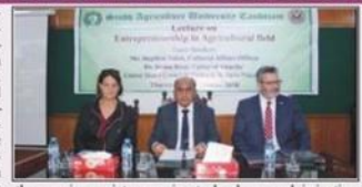
the agrarian society especially youth for vibrant and profitable agricultural sector through market linkages, technology, and irrigation; fostering a conducive business enabling environment for sustainable economic development.